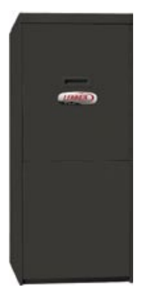
CBWMV Efficient, quiet comfort for virtually any home