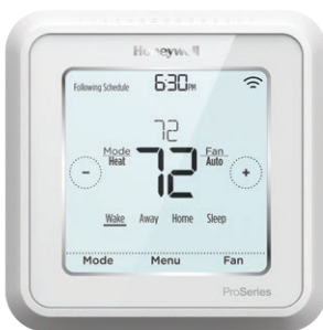
T6 Pro Smart

Whether you're home often or spend life on the go, Honeywell's T Series thermostats have the features you need for comfort and energy savings. All feature Honeywell's engineering excellence that's delivered comfort and efficiency for more than 100 years. All are backed by a 5-year warranty for peace of mind. And several options give you Wi-Fi connectivity for control from anywhere at anytime.